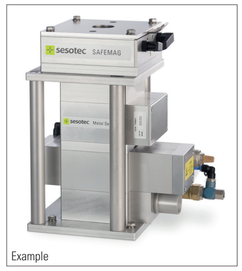
The SAFEMAG inline magnet also can be used as an optional add-on for the PROTECTOR metal separator.