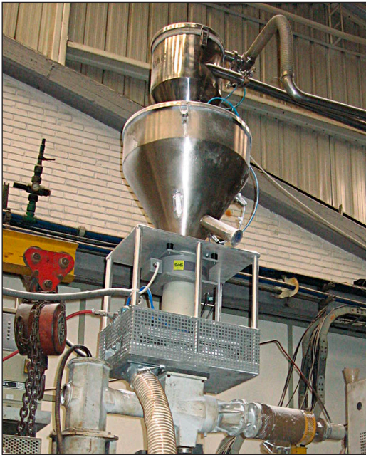
Installation example: Metal separator installed at the material infeed. (old version)

PROTECTOR-MF metal separators increase machine availability and productivity providing a fast return on investment.