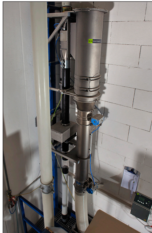
Installation example: GF 4000 metal separation systems installed in vertical pressure pipes. (old version)

Contaminated material is rejected into a container without any interruption to the production process. The reject container is emptied automatically.