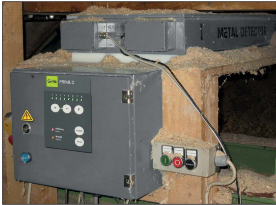
Installation example: Plate type detector ELS with control unit PRIMUS analysing wood off-cuts (old version)